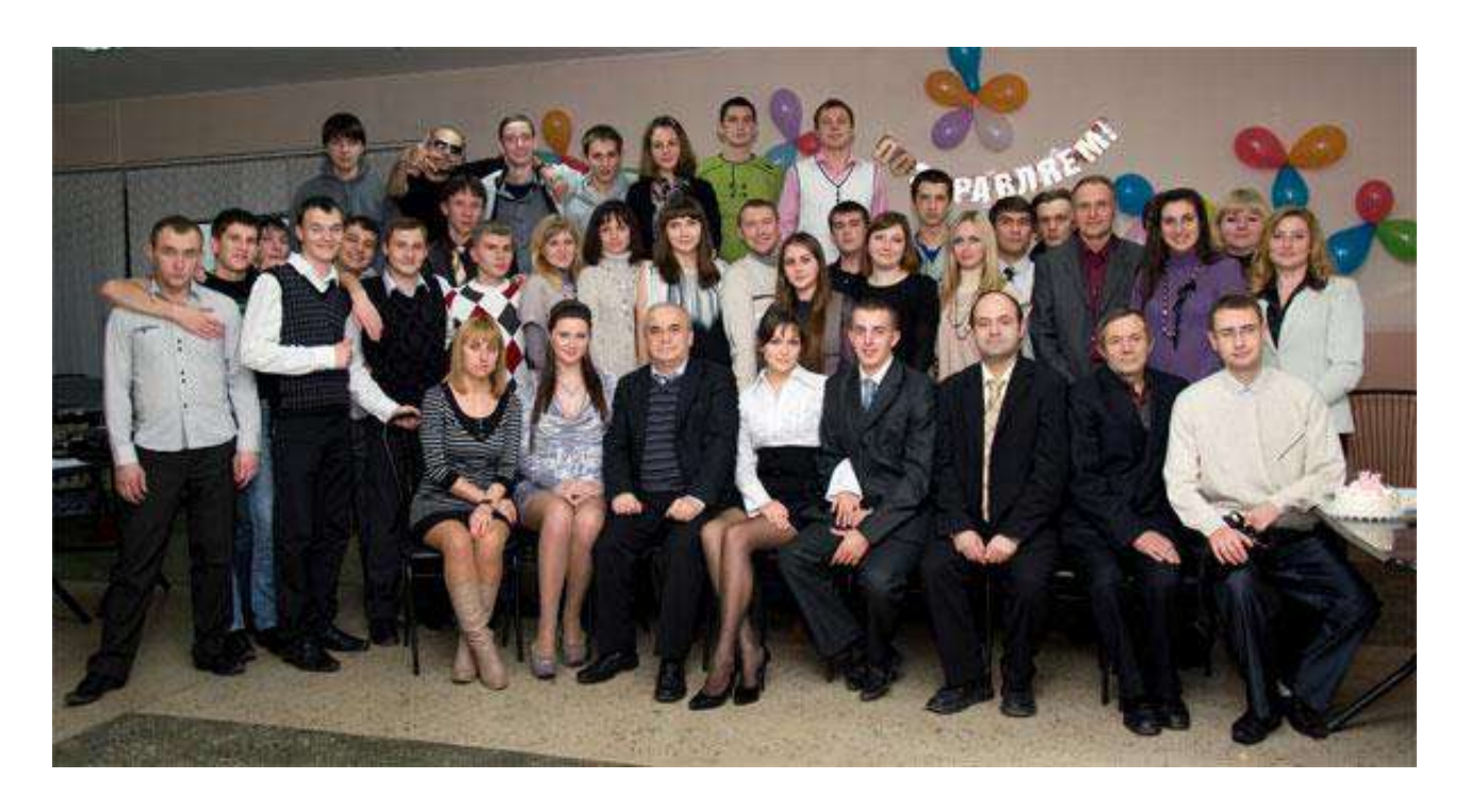
Participants of the traditional Evening of MF specialty, 2011 year