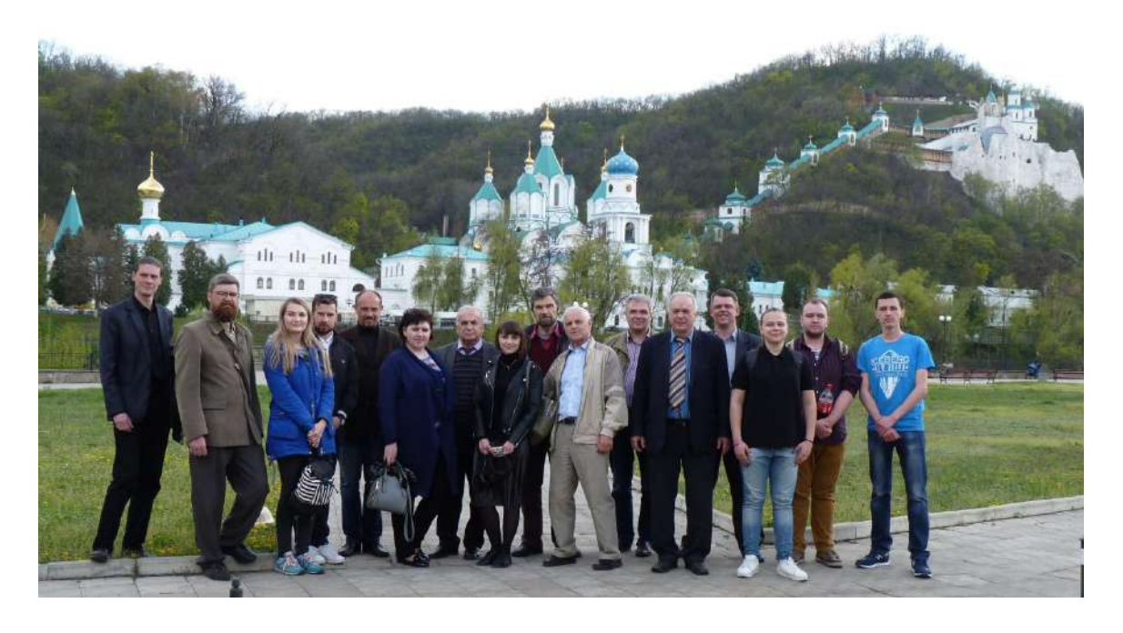
Traditional excursion of the participants of the International scientific and technical conference in 2004 (DSEA), 2012 (base "Tishina") and 2018 (Svyatogorsk Lavra)