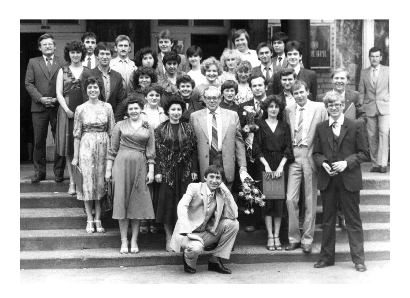
The second graduation of the day division of the Metal Forming Department, 1984