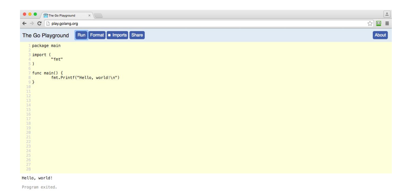
Figure 2: The "Hello, world!" Program in the Go Playground

If everything worked as planned, your program was compiled on Google's servers and executed, displayed the "Hello, World!" message, and then exited. This process is extremely fast because Go's compiler is highly optimized. Yes, your program is only a few lines long and pretty trivial, but as you start to write more sophisticated code, the Go compiler will surprise you at just how fast it is—especially if you are a Java programmer.